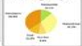
2010 Energy Consumption

What is the main source of energy used in US homes according to the pie chart?