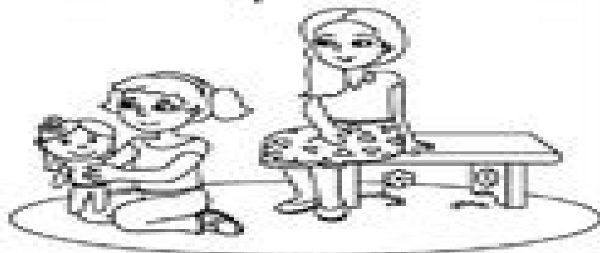
Playing while your parent is supervising