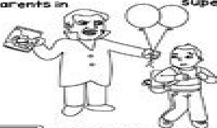
Stranger giving you a candy