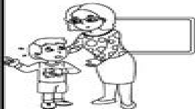
Telling your teacher about a stranger