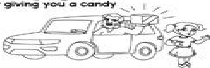
Stranger offering you a gift