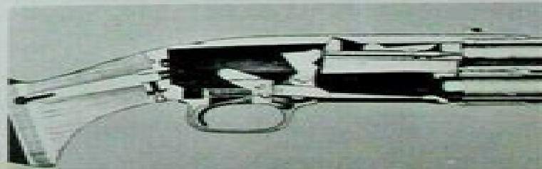
Model 12 Field Gun (Action Closed)