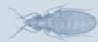
5TH INSTAR STAGE