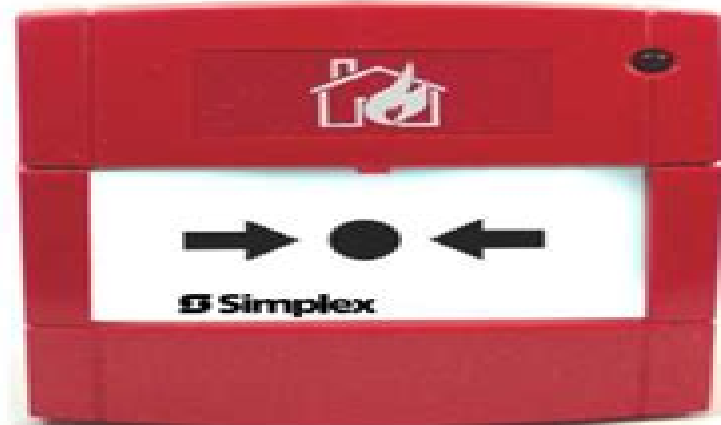
Figure 1: IDNet Addressable Manual Callpoint